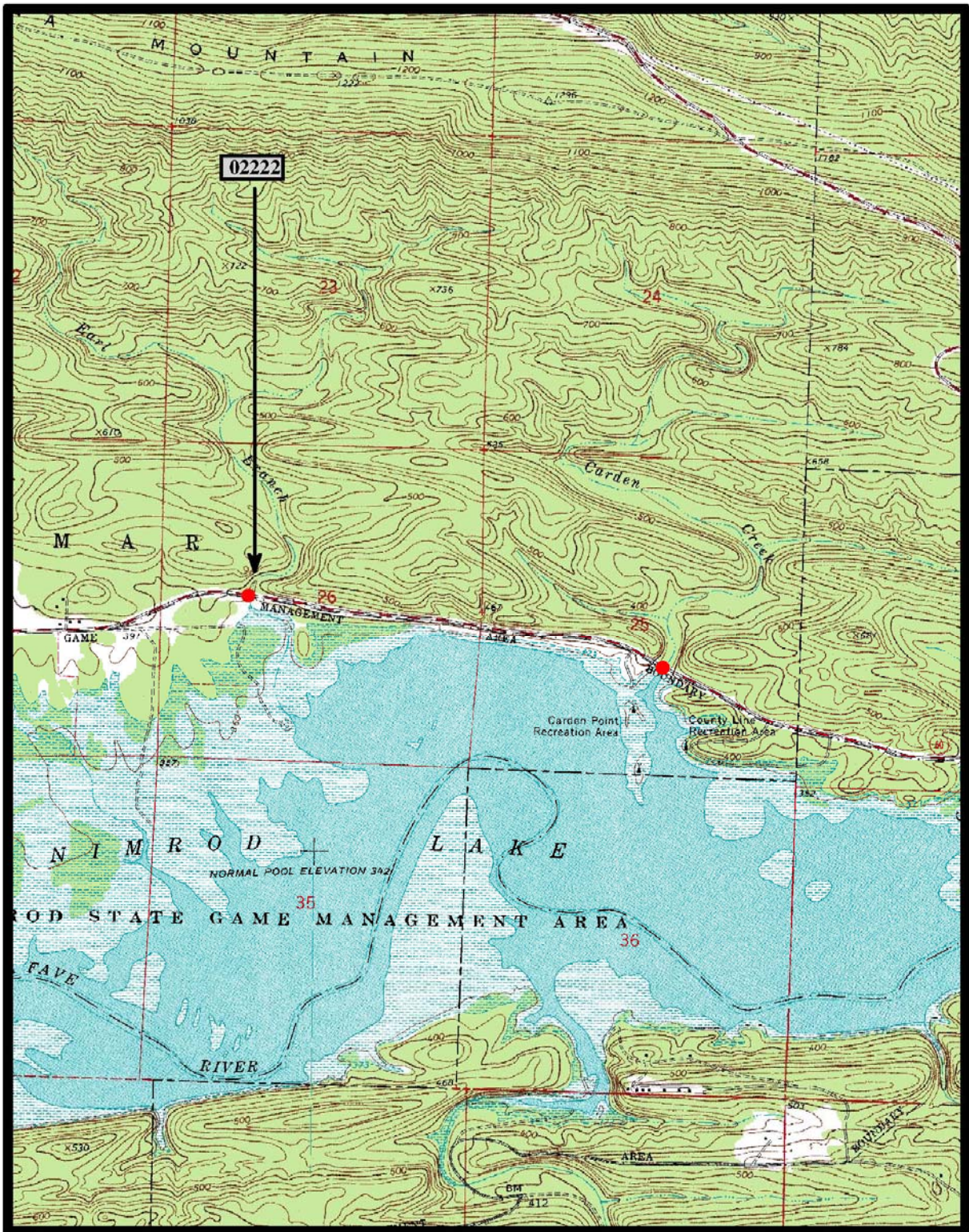
Hot Springs South 7.5 min. Quad